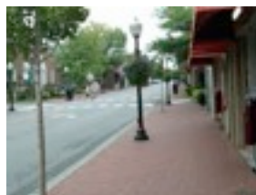
End photos above taken at VCOM, Blacksburg, Virginia