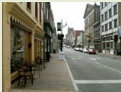
(Staunton, VA site of the December 9 and 10, 2010 Virginia Rural Health Association Conference: Generating Ideas for Rural Health)

health centers in New Orleans. From Philanthropy News Digest .